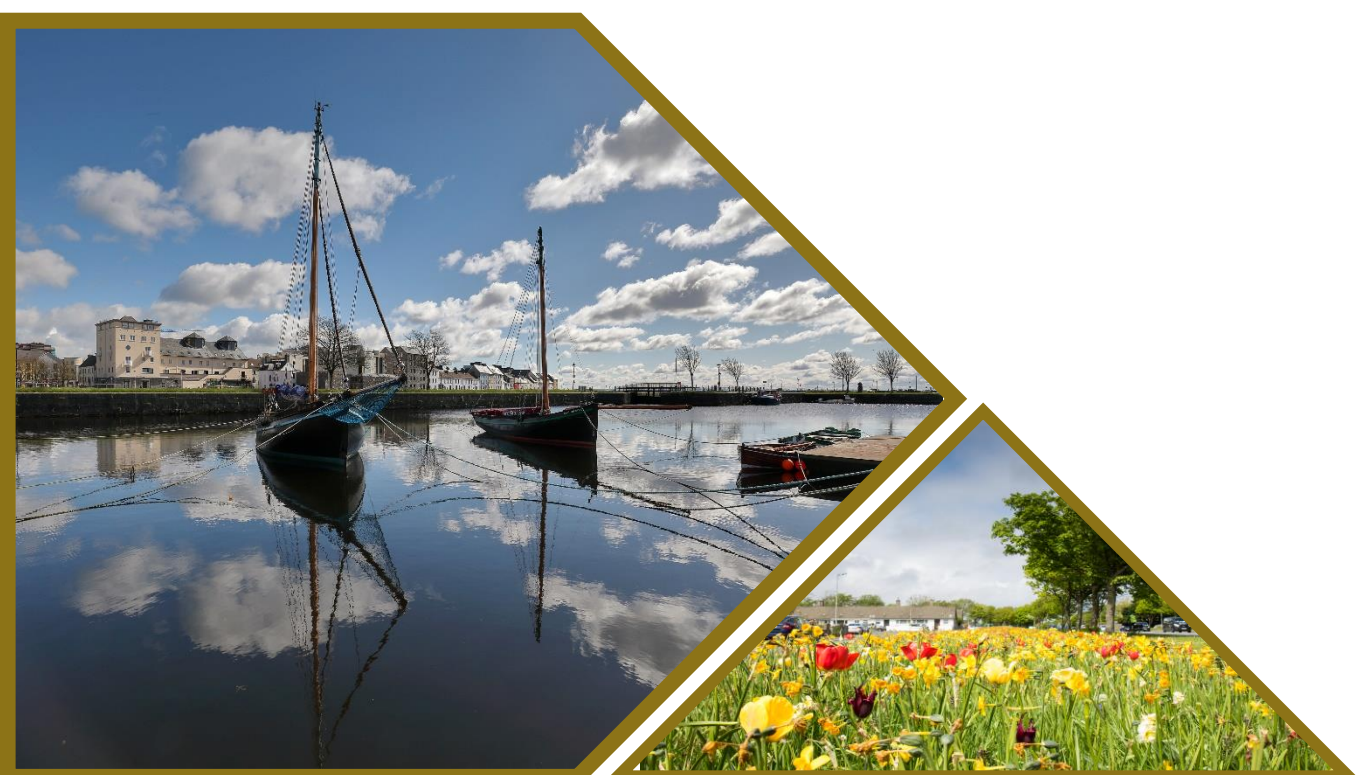
Claddagh boats