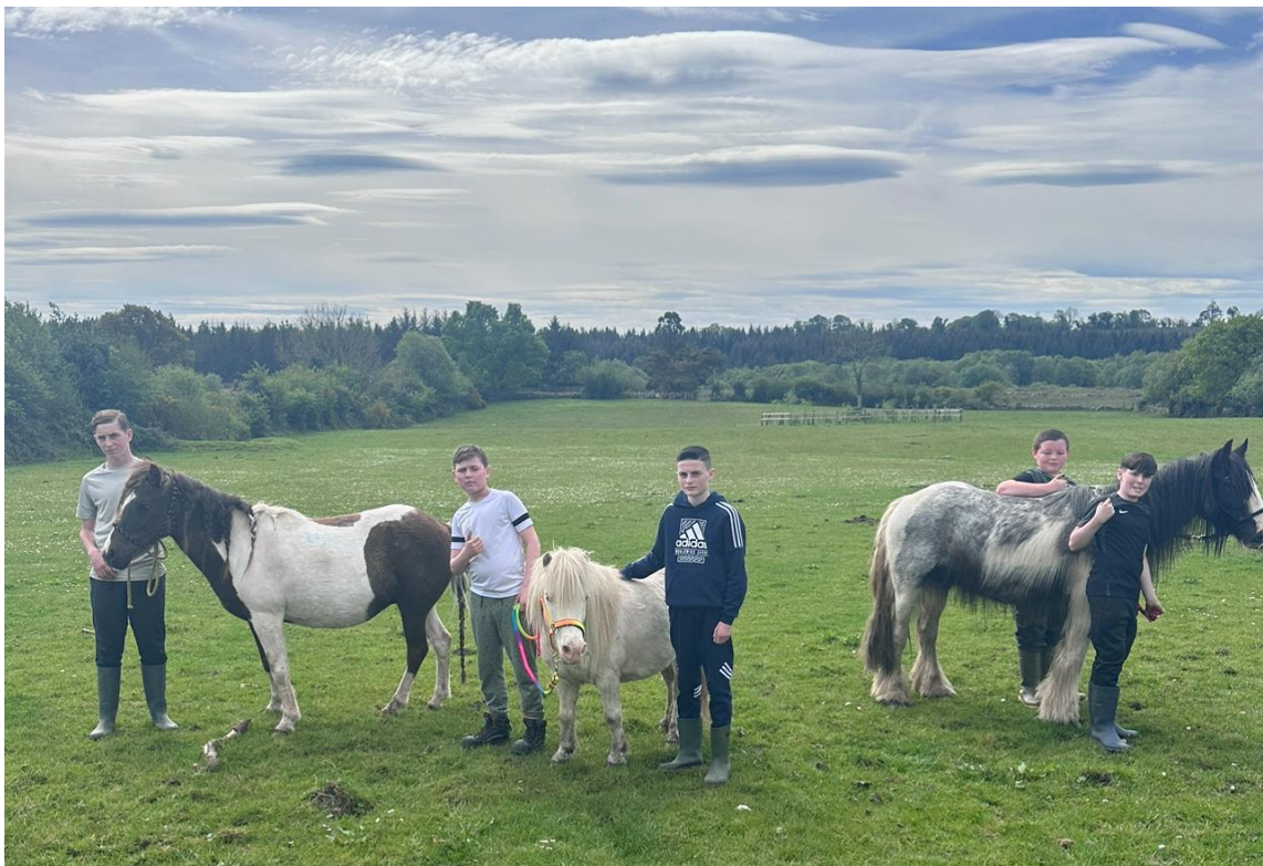
Participants in the Galway Traveller Movement Equine Therapy programme

GTM acknowledges that through the HGC fund in 2024, a key achievement has been the high levels of participation from the Traveller community across Galway City in a wide variety of actions, allowing the delivery of important messages of positive mental health and wellbeing and engagement with some of the most marginalised in society.