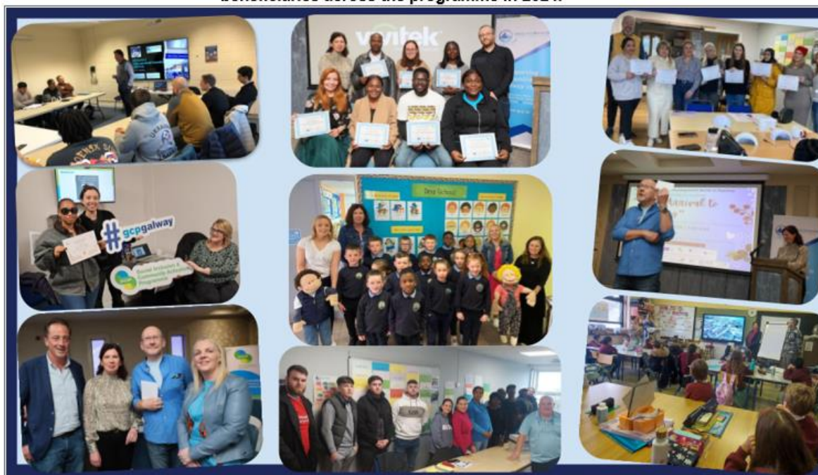
This collage illustrates just some of the work undertaken and delivered to support SICAP beneficiaries across the programme in 2024.

Mental Health - The importance of social connection was identified as paramount in 2024 and feedback highlighted the benefits of involvement in community groups with improved mental health. The numbers of men engaging previously had been quite poor. The need to engage with more men in the community was identified as being key and the formation of 4 new Men's Groups and also a very successful pilot workshop with CROÍ focusing on men's heart health on International Men's Day.