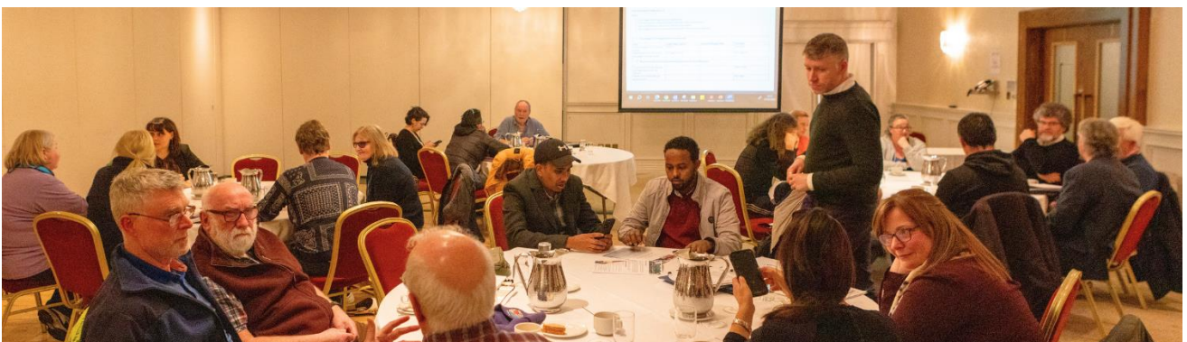
GCCN members in attendance at GCCN Spring Plenary 2024

GCCN also made two submissions on the new Draft Strategic Policy Committee Scheme, one of which was a joint submission with the Galway Council of Trade Unions. Further joint submissions were made on the Traveller Accommodation Programme 2025-2029 with Galway Traveller Movement and on the National LGBTI+ Inclusion Strategy with Amach! LGBT+. Collaboration and partnership underpin GCCN's work. In 2024, GCCN continued to work with Galway City Partnership on the Intercultural Strategy and to attend the Community Integration Forum.