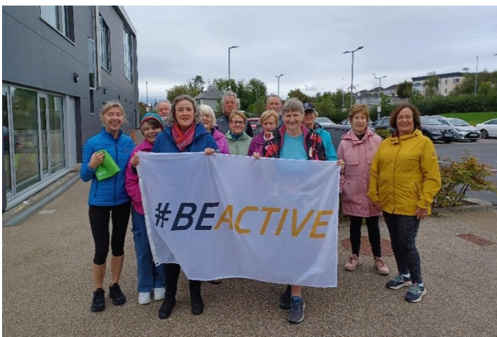
Ballinfoile Castlegar Walking Group celebrate BeActive Week

HGC and GSP continued to support local community walking groups in Ballybane and