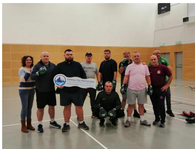
Ballinfoile Traveller Men's Group

HGC and GSP continued to collaborate on events and activities promoting physical activity, sports and exercise across a broad spectrum of the community. These included: