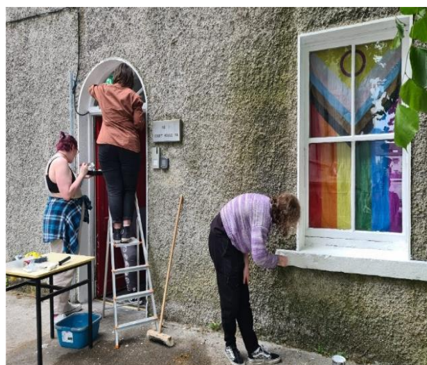
Teach Solais LGBT+ Resource Centre: No 1 Courthouse Square

The CDP funding secured by AMACH LGBT+ also aided the roll out of community surveys to ascertain what social groups or events the community would like to see in the space as well as volunteer to co-run. These surveys led the organisation to set up various groups and clubs such as the book club, writing club and film club who regularly meet in the resource centre. In addition, the organisation ran a series of health and wellbeing workshops and talks during the year.