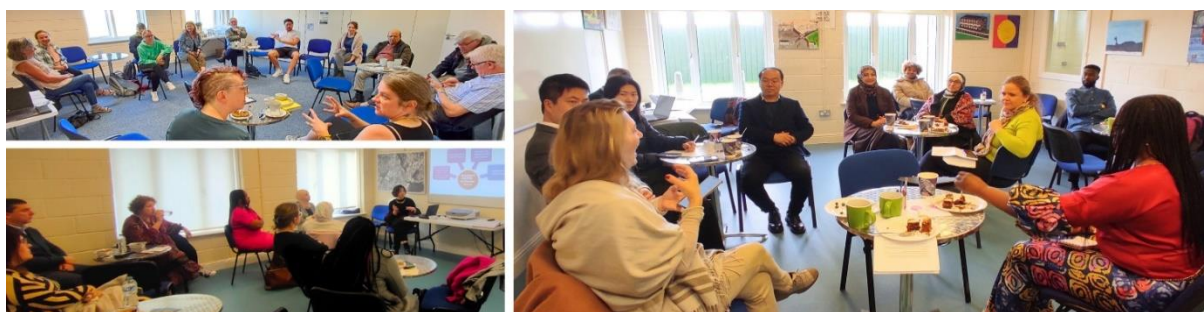
Members in attendance at GCCN Induction and Coffee Mornings in 2024

Other training sessions co-hosted by GCCN, included a number of Volunteering Trainings with the Galway Volunteer Centre and Strengthening Irish and Palestinian NGO Partnerships with The Sumud Network and the Galway Volunteer Centre. A number of informal events entitled GCCN Coffee Mornings were organised to celebrate with the community important dates such as the International Mother Tongue Day, World Environmental Day and World Peace Day. These were well attended and offered stimulating networking opportunities.