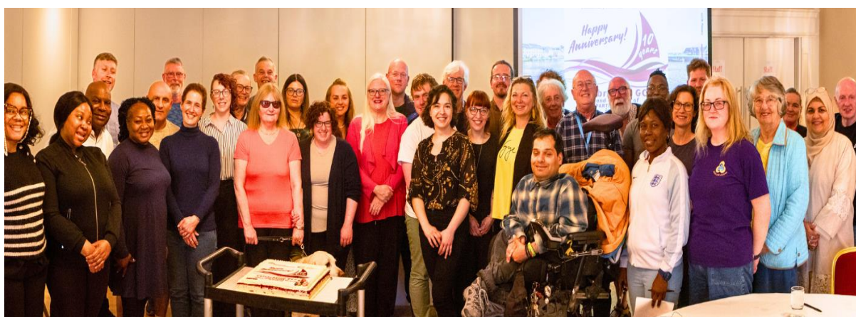
Members celebrating 10 years of GCCN in 2024

Galway City Community Network Líonra Pobail Chathair Na Gaillimhe