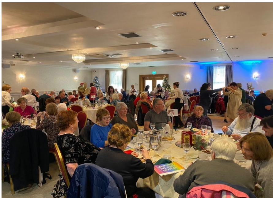
2024 HGC and GCP Christmas Lunch event for older adults experiencing social isolation and loneliness

Three Community Singing groups are now strongly established in these locations, and act as open and inclusive spaces for all members of the community. The groups meet on a weekly basis throughout the year and each group has performed publicly at events in the city to promote positive mental health and wellbeing.