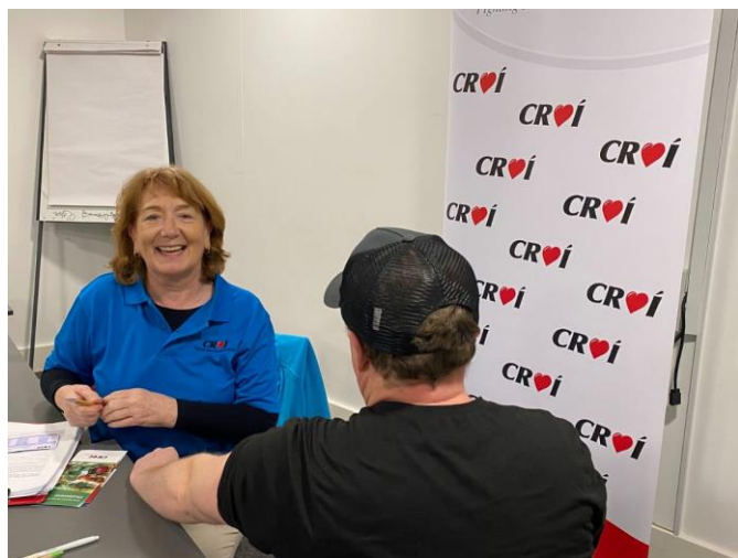
Croi Heart Health Checks with the Ballinfoile Traveller Men's Group

A boxing fitness programme targeting traveller men was delivered in Ballinfoile and was very well received by the participants, with the group planning to continue their activities and introduce strength and conditioning training in 2025. Walking Football for Over-55s in Ballinfoile was also hugely successful. Partnering with Galway City Partnership (GCP) for these programmes, Croi Heart Health Checks was included as an optional add on and many men experienced their first ever heart health check-up and blood pressure monitoring.