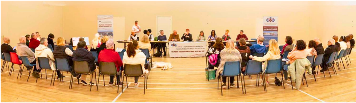
Attendees at Meet the Candidates – East Ward event in May 2024

In line with its work around public participation and engaging marginalised groups in public consultations, GCCN continues to support its linkage groups and members to produce policy submissions on matters of relevance to them. In 2024, these included submissions on the Heritage Plan 2024-2029, Kingston Park and Millers Lane, the Pedestrian and Cycling Crossings at Browne Roundabout, the Strategic Policy Committee Standing Orders and the Galway City Council Corporate Plan.