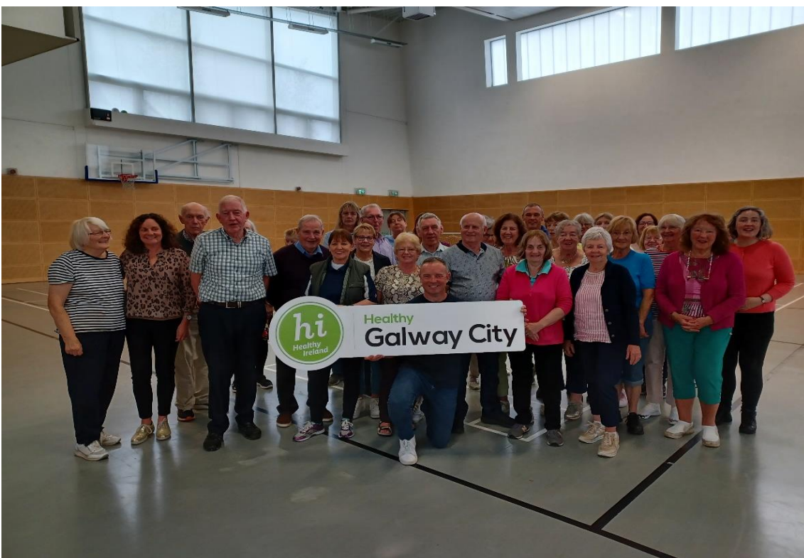
The Ballinifoile Castlegar 'Social Steps' class

HGC was funded through the Galway City Creative Communities Grant to coordinate the 'Social Steps' Dance pilot. Working in partnership, the GCP Development Team and HGC delivered six weeks of social dance workshops in three areas of Galway City (Ballybane, Shantalla / Westside, Ballinifoile / Castlegar). An average of 80 participants attended the three community-based workshops on a weekly basis, and the pilot was so successful that a year-long programme is in development for 2025.