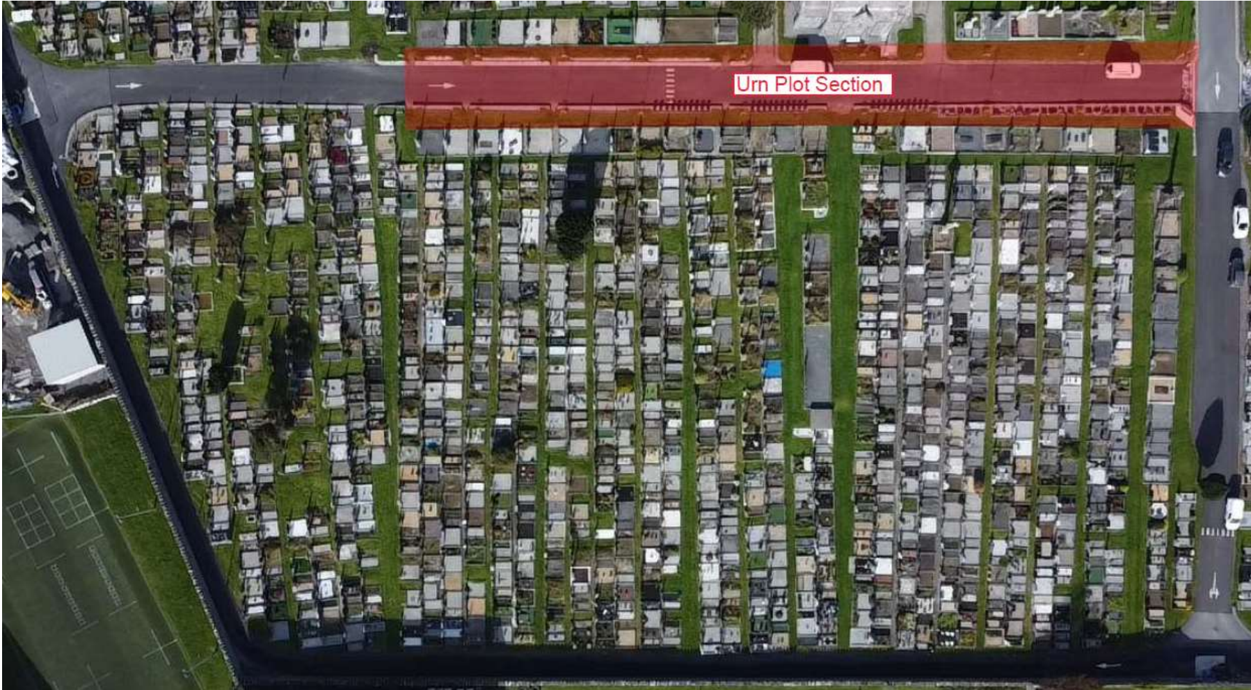
Bohermore Cemetery Urn Plot Section.