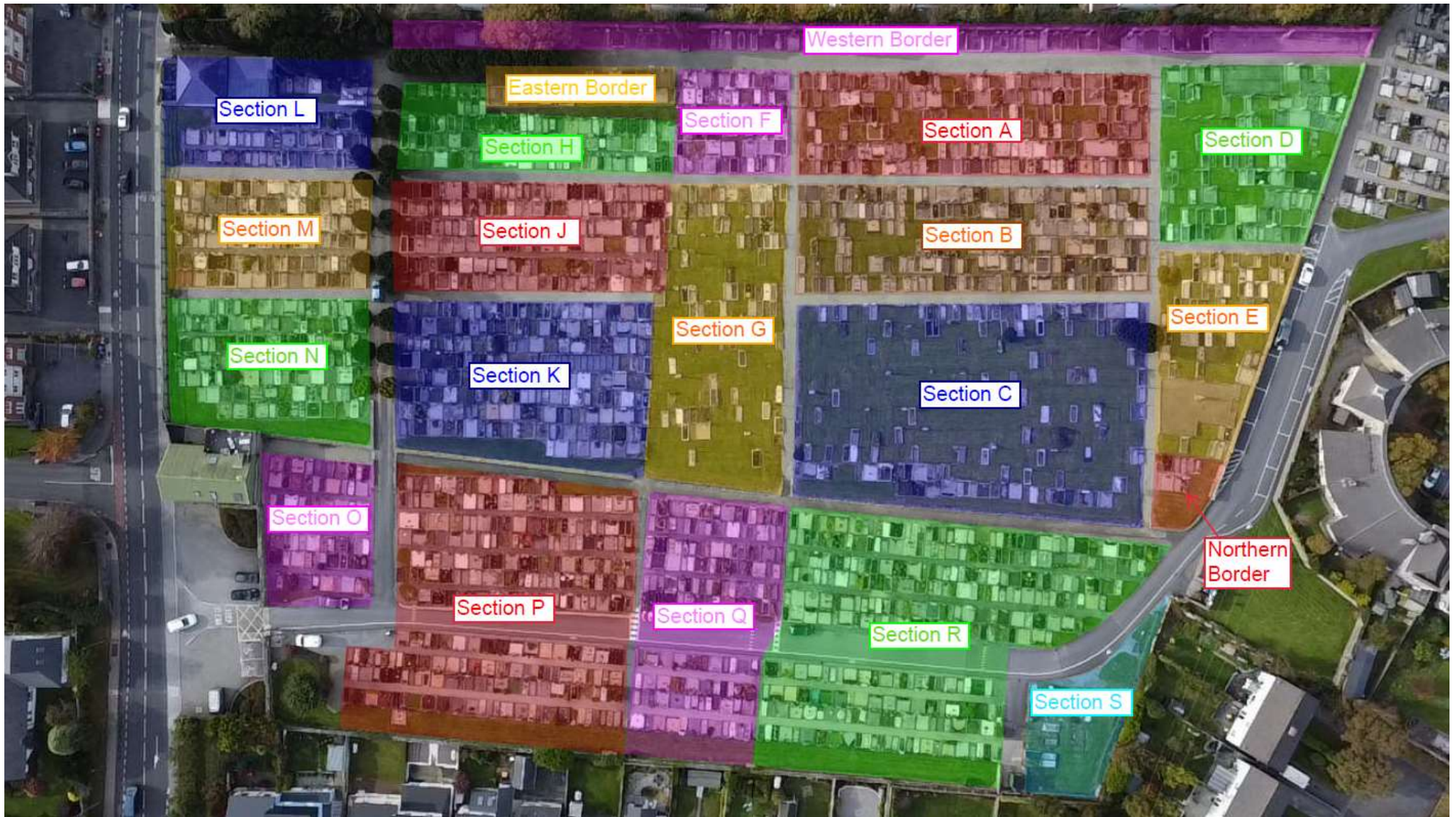
Ragoon Cemetery. Traditional/Kerbed Plot Sections A to S (There are no Sections I, T, U or V in Ragoon Cemetery)