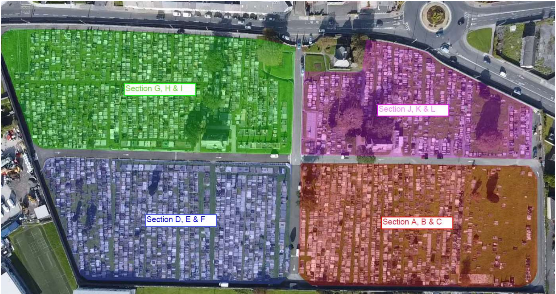
Bohermore Cemetery. Traditional/Kerbed Plot Sections A to L