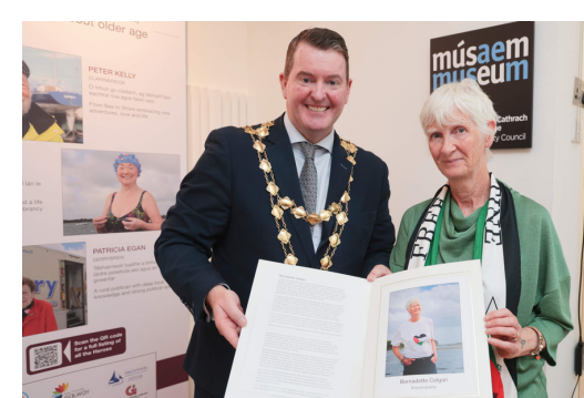
SOME OF OUR GALWAY CITY LOCAL HEROES 2024