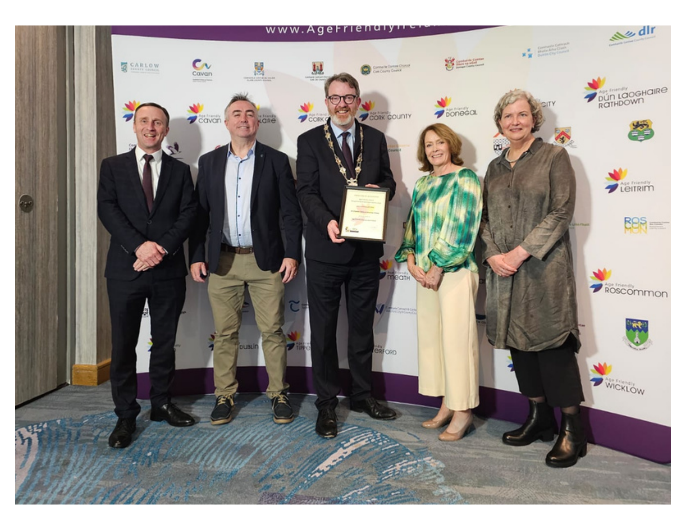
Galway City Council staff at the National Age Friendly Recognition and Achievements Awards

An Cliathán integrates modern design with principles of accessibility and sustainability , ensuring that residents enjoy high-quality living spaces that support aging in place. The development includes features such as barrier-free entrances, accessible transport links, communal spaces, and a focus on green areas—all of which promote active lifestyles and community engagement.